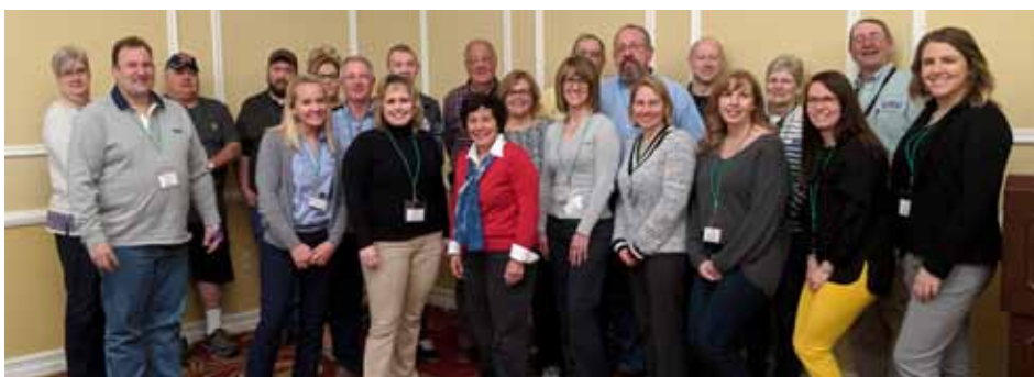
IAFE Zone Meeting, Rockland, Maine